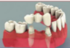
CROWNS & BRIDGES